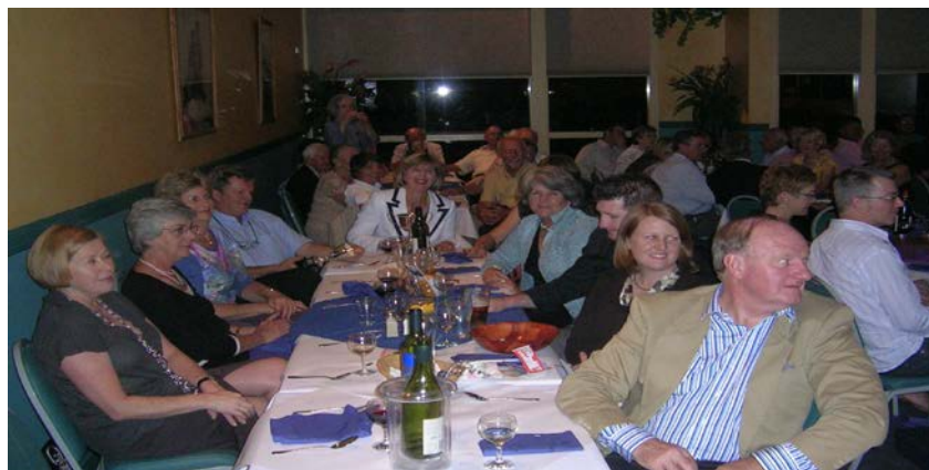
Some of the crowd.