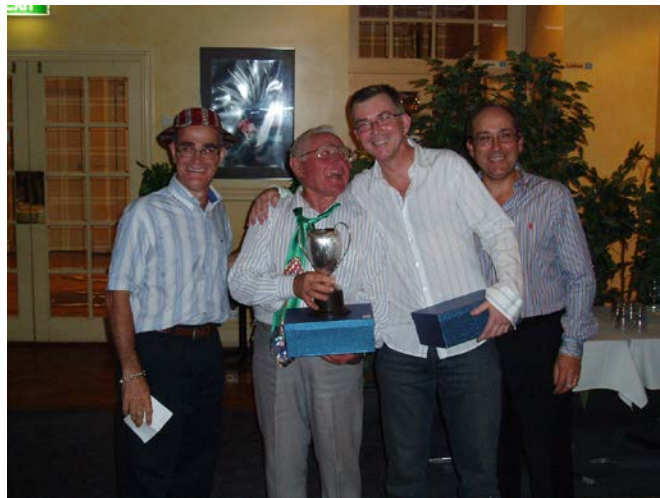
Winners are grinners!!!!!!

A HUGE thankyou to all those responsible for organising Presentation Night last week – coordinating with the restaurant, setting up the room, organising prizes and raffles, champagne at the door - what more could one ask for!!! It was a really enjoyable evening with great company and a very fitting way to end our year. Thank you to all those who attended and made this such a great evening.