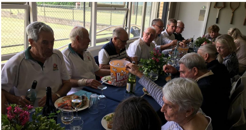
Tennis can wait when a seafood luncheon is available