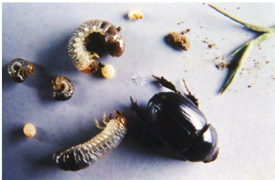
African Black Beetle larvae and adult

Keeping our courts in good repair, requires constant vigilance, so let us know if you spot any unusual pest activity. The quicker we get on to it, the sooner we can send the pests packing.