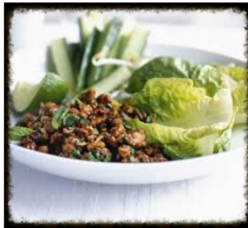
TENNIS & THAI - EAT IT & BEAT IT

Wonderful Caroline Swan has kindly volunteered to organise an end of year Badge ladies lunch to celebrate the season - Details will follow.